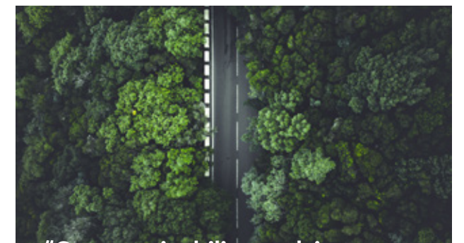
"Our sustainability work is a fully integrated part of our business activities."

Nobina has taken on the transport challenge from Fossil Free Sweden to conduct and purchase fossilfree domestic transport by 2030.